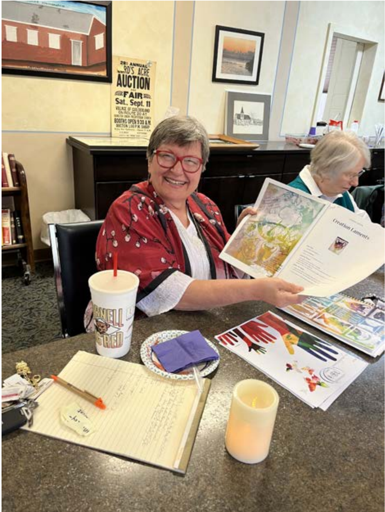
Westminster Presbyterian Church partnership